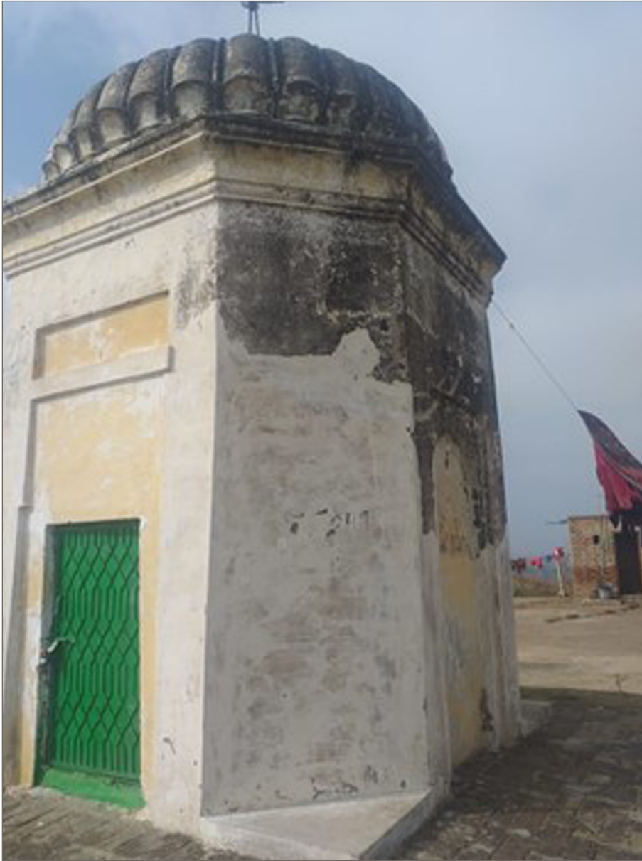
Figure 5 A General View of Samadhi at Dhuman, Distt. Chakwal.