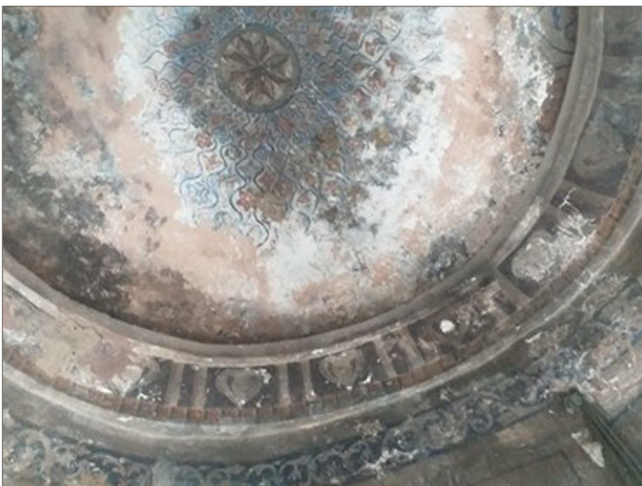
Figure 6 Fresco Painting along Ceiling of Smadhi at Dhuman, Distt. Chakwal.