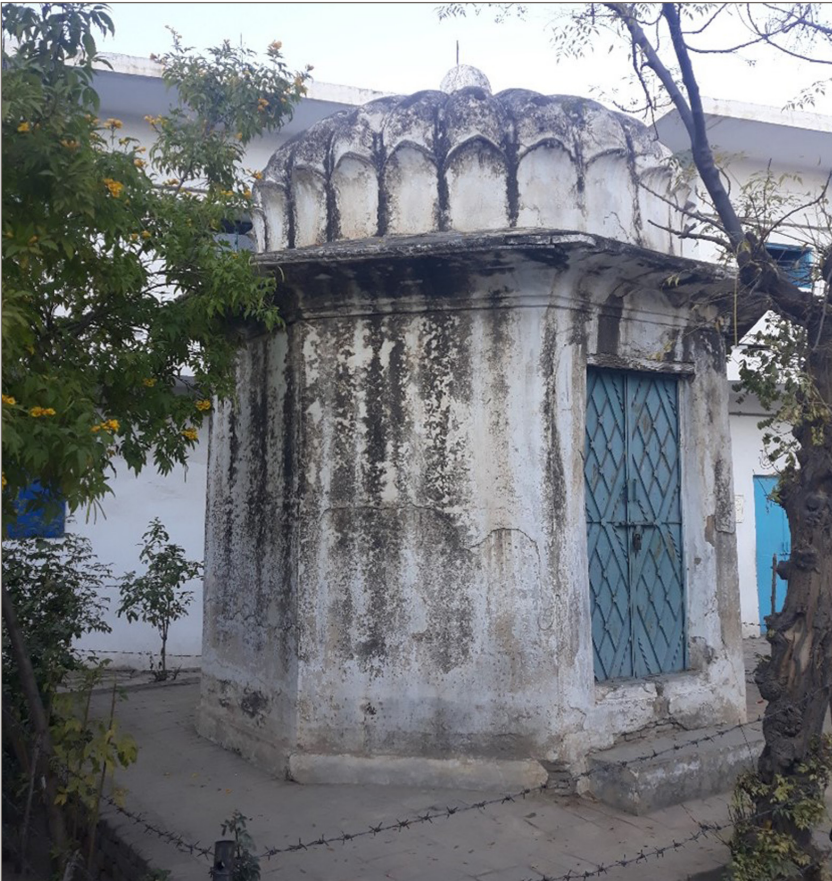
Figure 8 A General View of Samadhi in Main City Chakwal.