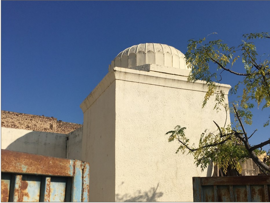
Figure 2 A General View of Samadhi II at Karyala, Distt. Chakwal.