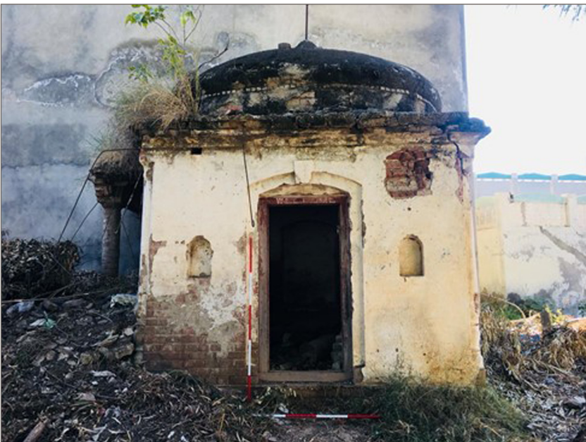
Figure 9 A General View of Samadhi at Talagang, Distt. Chakwal.