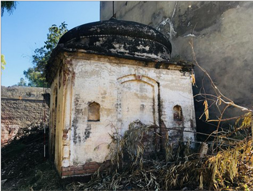
Figure 10 Lateral View of Samadhi with Concentric Blind Arches Flanked by Alcoves.