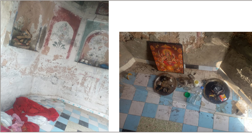
Figure 7 Mural Frescos and Ritualistic Materials Inside Samadhi at Dhuman, Distt. Chakwal.