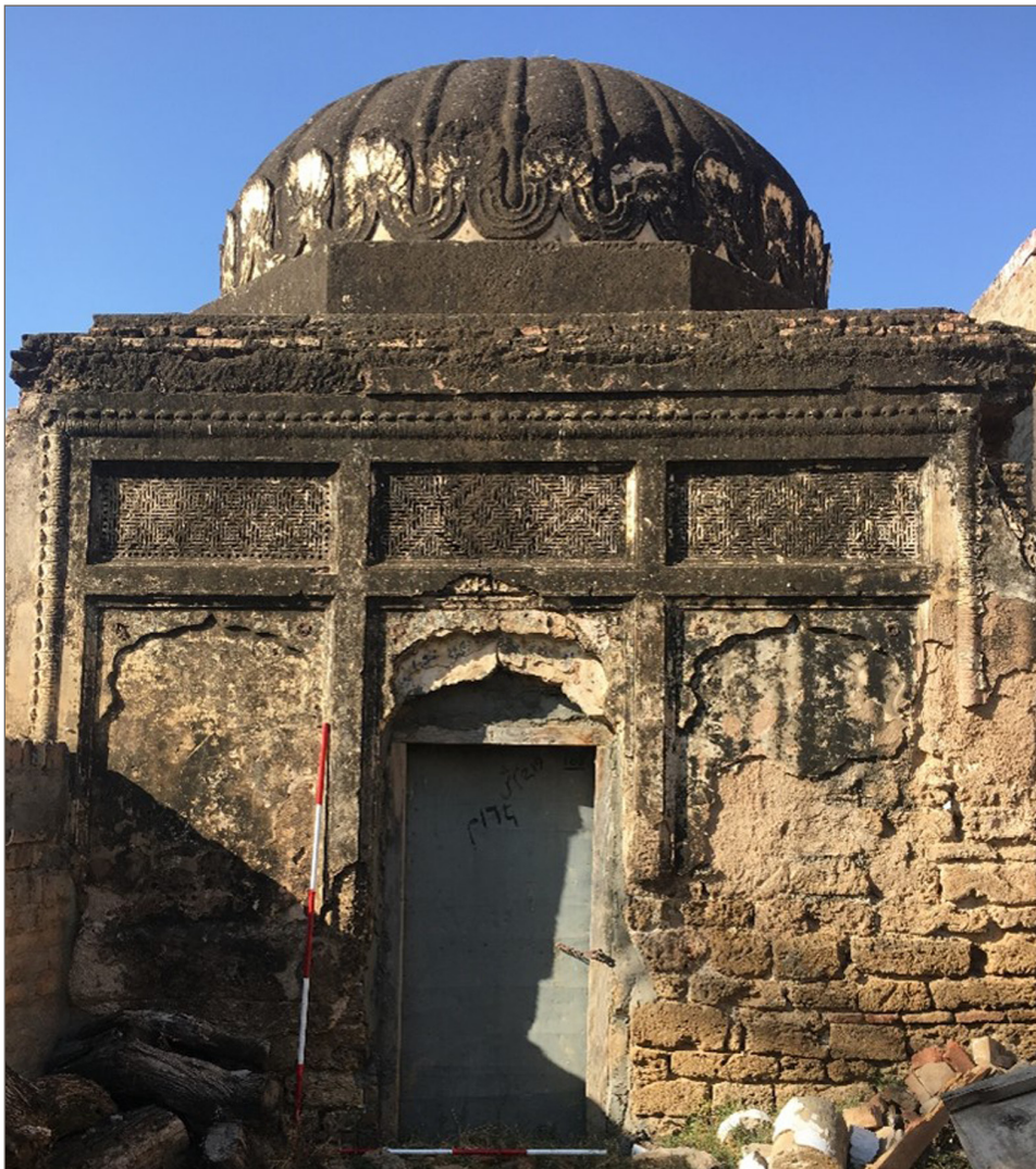
Figure 1 A General View of Samadhi I at Karyala, Distt. Chakwal.

District Chakwal gone through a series of research in different times. The archaeological potential of district Chakwal has been mentioned by various explorers—Alexander Cunningham (Cunningham 1872: 188–192; Cunningham 1875: 79–94), Aurel Stein (Stein 1937: 45–66), Saifur Rehman Dar (Dar, Saifur Rehman 2001: 34–60), Sadeed Arif, Sabeena Iqbal (Iqbal, Sabeena et al 2006: 163–183; Iqbal, Sabeena 2005: 157–163) and Hadiqa Imtiaz (Imtiaz 2019: 566–579, Imtiaz et al 2020: 7–21, Imtiaz and Zahra 2020: 126–148).